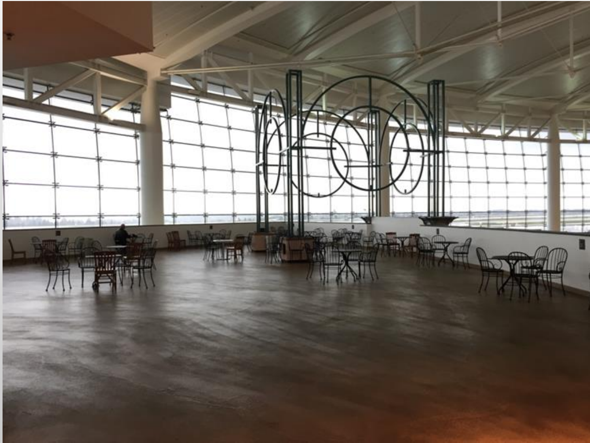
Mezzanine Level South – unleased space above dining units today